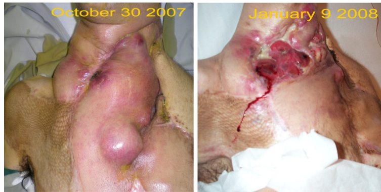
Figure 2 Clinical improvement and dramatic shrinking of the tumor.

DFSP is considered as one of the radiosensitive tumors. Earlier studies suggested that additional postoperative RT reduces the risk of local recurrence in patients with questionable or positive surgical margins [46,47]. When complete surgical resection is unachievable, RT is indicated [46,48]. RT can reduce the morbidity or functional impairment associated with extensive resection.